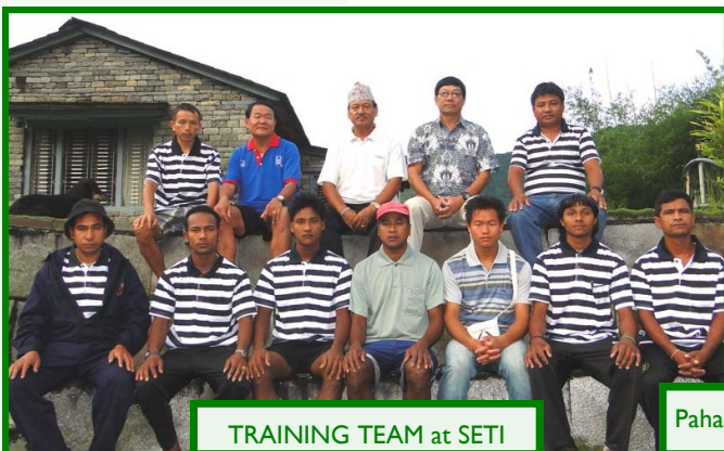
TRAINING TEAM at SETI

remain any number of essential schools projects in Nepal for us invest in. Having opened the new hostel accommodation at Gilung a few years ago, I was well aware of the high standards of construction demanded by the Trust and the excellent value for money achieved through close attention to cost and standards by the project managers as well as the crucial involvement of local communities in jointly seeing a project through to successful completion. But it was good to hear again how this remains such a central tenet of the Trust's activities. I was also most impressed to hear of teacher mentoring initiatives and the quite excellent library programme in hand in concert with the Cairn Trust. All in all a most worthwhile visit, and I look forward to getting out on the ground next time to see further evidence of the Trust's good works in the hills of Nepal."